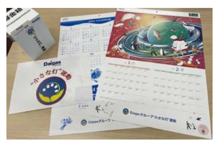
A charity calendar for raising donations from Daigas Group employees, alumni, other relevant parties and customers

The Small Light Campaign gathers funds through various activities, including charity calendar donations and proceeds from the Midosuji Fureai bazaar, a used book bazaar, as well as donations from workplace groups, individuals, and the Suzurankai (Osaka Gas alumni) — all managed as the Small Light Fund. The money is used to support the activities of the Small Light Campaign, to support recovery in disaster-hit areas, and to donate items for social welfare or educational purposes, such as wheelchairs and picture books, to all municipalities served by Osaka Gas.