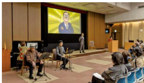
Holding a Storytellers' Theater performance at Open House Osaka

Local communities face many social issues, and these issues are becoming more advanced and complex. The Daigas Group regards the practitioners of "My Project = Starting to Solve Social Issues by Considering Them as if They Were My Own" as future partners in livening up communities in the Kansai region. The Group disseminates their activities to society and aims to collaborate with various stakeholders.