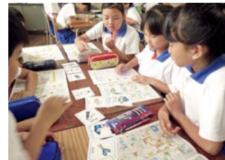
"Lessons in Disaster Response," in which children learn in a workshop format how their lives can change during a disaster and useful knowledge for disaster preparedness