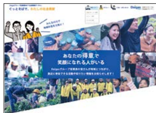
The Social Contribution Portal Website: an in-house bulletin board that provides employees with information on volunteer activities, etc.

In FY2023.3, we launched the “Social Contribution Portal Website” to encourage participation in community contribution activities.