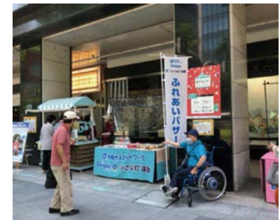
The Midosuji Fureai bazaar held for the first time in two years

The Midosuji Fureai bazaar, an initiative to support the employment of people with disabilities, was held in cooperation with many partners, under the themes of health and disaster prevention and mitigation.