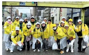
To support the Osaka Marathon 2024, 79 employees participated in the event as volunteers.