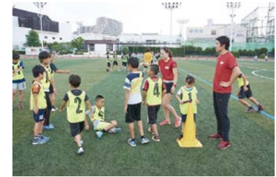
NOBY T&F CLUB training program

Furthermore, we disseminate information on tips for rich eating habits and body building that lead to good health through seminars, websites, and SNS.