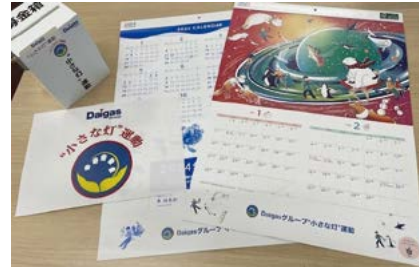
A charity calendar for raising donations from Daigas Group employees, alumni, other relevant parties and customers

The Small Light Campaign gathers funds through various activities, including charity calendar donations and proceeds from the Midosuji Fureai bazaar, a used book bazaar, as well as donations from workplace groups, individuals, and the Suzurankai (Osaka Gas alumni) — all managed as the Small Light Fund. The money is used to support the activities of the Small Light Campaign, to support recovery in disaster-hit areas, and to donate items for social welfare or educational purposes, such as wheelchairs and picture books, to all municipalities served by Osaka Gas.