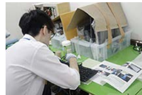
PC recycling work at a welfare workshop

This program is a social contribution activity that aims to contribute to the environment through the reuse of PCs, support the employment of people with disabilities through the outsourcing of PC refurbishment work and provide IT support to the recipients of the PCs. Since this program started in 2009, it has donated 4,942 PCs (as of March 31, 2024) to social welfare organizations. In FY2024.3, the 14th Daigas Group Hajimaru-kun Personal Computer Donation Program donated 190 "Hajimaru-kun PCs" to 130 welfare facilities in six prefectures in the Kansai region, Japan.