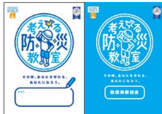
Left: Learning material for upper grades of elementary school (A4, 40 pages, full color) Right: Teacher handbook (with worksheets and supplementary teaching materials for the class, A4, 40 pages, full color)

In response to the increased need for disaster response education following the Tohoku earthquake and tsunami of 2011, we created an original textbook for an upper elementary school on the theme of disaster response Lessons in Disaster Response that we distribute to local elementary schools. The textbook teaches children about natural disasters in Japan. While studying it, children take a workshop designed to impart useful knowledge about the changes that take place in people's lives when a disaster strikes. The textbook also contains a checklist of items to prepare and things to do at home to prepare for emergencies. Over a period of ten years, the textbook has been used widely at junior high schools, high schools, and universities, as well as by local governments and local residents' associations. Over 260,000 textbooks in total have been distributed.