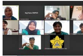
Online exchange between Syiah Kuala University in Indonesia and Kwansai Gakuin University