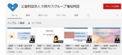
Video content “Health Seminar for the Elderly”

We will continue to annually distribute content that can be used for health promotion in the elderly.