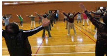
Health-promotion project: Gathering for health promotion

In FY2024.3, the Foundation provided 6.90 million yen in subsidies to 61 welfare projects for the elderly, and 8.88 million yen in subsidies to 13 investigation and research projects, and carried out 108 health-promotion projects involving 4,742 participants.