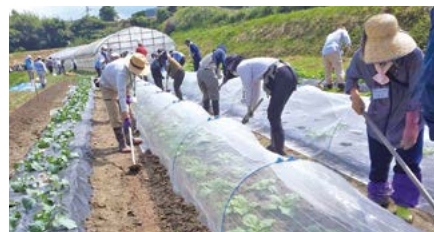
Subsidy for the welfare of the elderly: Subsidy for farm tools for agricultural workshop courses