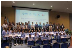
Commemorative photo with scholarship recipients and their families at the presentation ceremony at National University of East Timor

We will continue to launch new activities and expand the scope of support.