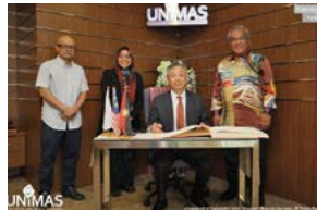
Courtesy call to Universiti Malaysia Sarawak