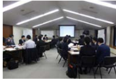
Training for young employees

After acquiring basic conduct and attitudes as a member of society through introductory training at the time of employment, each employee receives follow-up training every year to enhance the abilities required at each stage of growth. For the same period, an instructor assigned to each newly hired employee provides guidance on work to promote further growth.