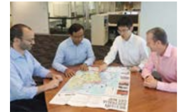
Our employee who experiences working overseas under the Trainee System (second from right)

Overseas Trainee System (a system under which employees are assigned to affiliated companies under the Energy Resources & International Business Unit or overseas research institutes as trainees for a certain period of time), short-term overseas language training, etc.