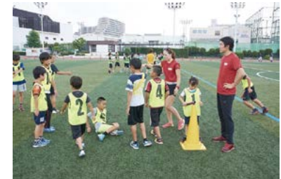
NOBY T&F CLUB training program

Furthermore, we disseminate information on tips for rich eating habits and body building that lead to good health through seminars, websites, and SNS.